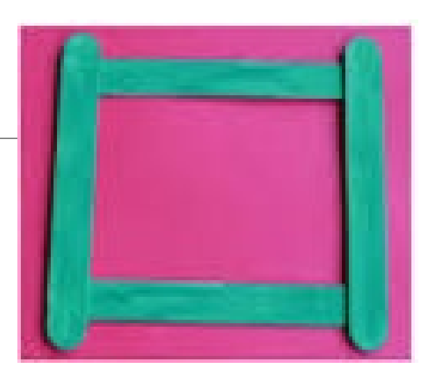
6 Stick Frame